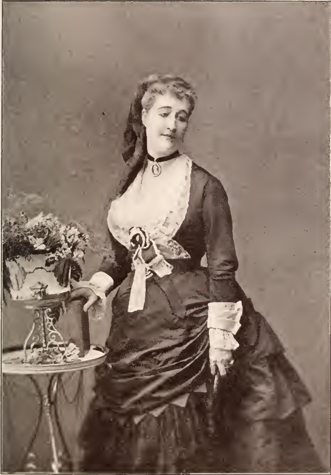
THE EMPRESS EUGÉNIE.

From a photograph taken by W. and D. Downey in 1871.